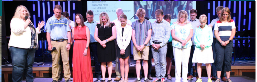
Nigeria & South Africa Missions Trips