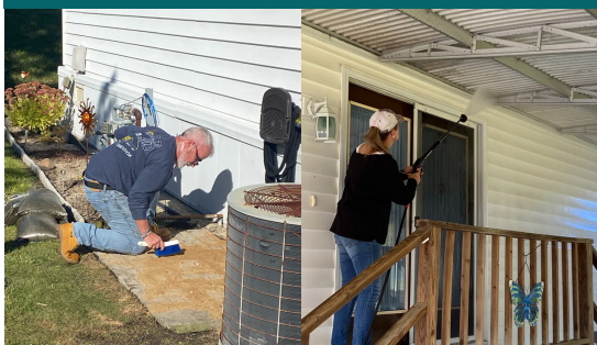
Senior Assist 2022