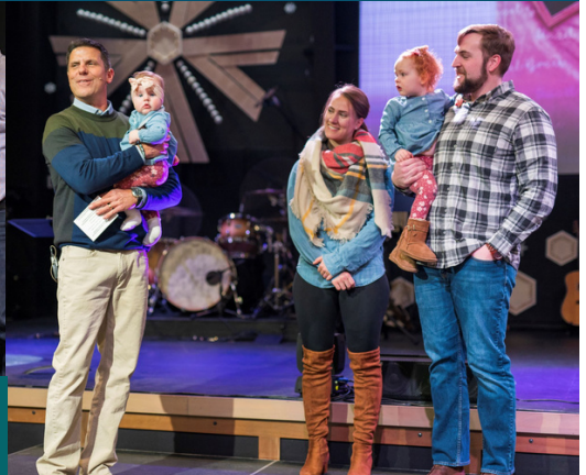
Inclusive Playground Community Kick-Off