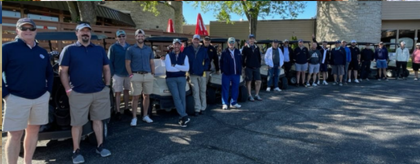
Men's Golf Outing